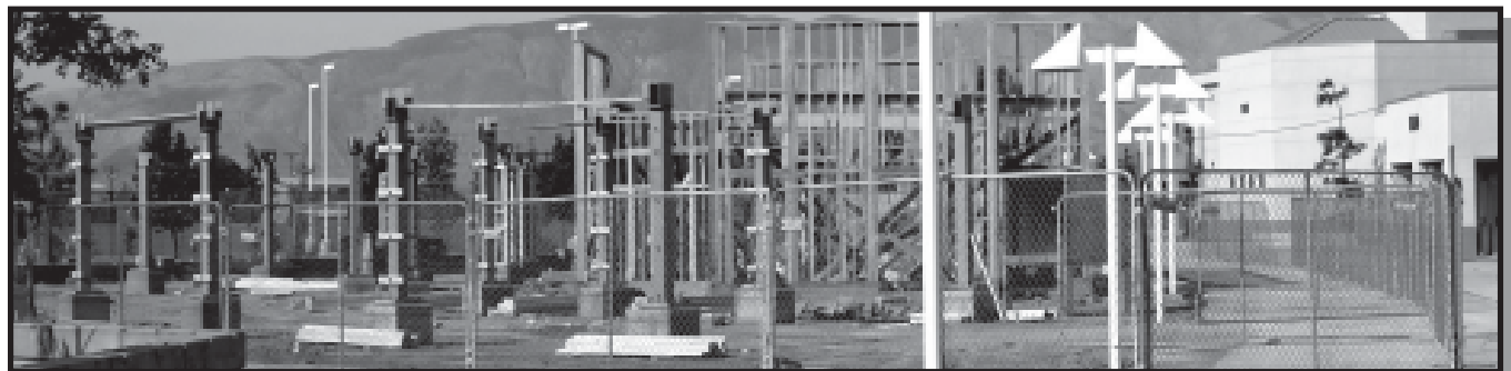
Tahquitz High School Stadium Construction

* Budget will be adjusted/increased when the second series of bonds are issued